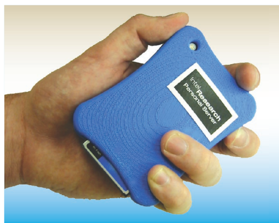
Figure 3 A Personal Server prototype

Once again autonomic principles are required for this system to be successful, establishing a sense of self for the Personal Server and guarding against possible adverse data or programs that may be pushed onto it. In addition, proactive techniques are required for predicting the types of data the user needs, based on previous data access patterns or the context of the user.