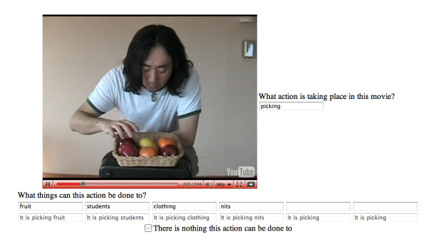
Figure 2: A screenshot of a user completing a task to find objects of a particular verb, where the verb is represented by a film. After the user has written a verb and a noun, a protosentence is formed and shown to ensure that the user is using the words in the appropriate roles.

These subjects and objects we collected were then used as inputs for a second task. We showed workers videos with potential subjects and objects and asked them to create pairs of sentences with opposite Transi-