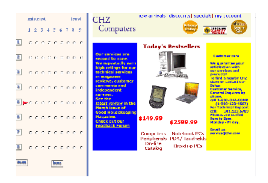
Fig. 4. The experimental web site

Subjects were presented with the experimental interface that is divided into two frames. The left frame contains links to the eight web pages. Initially the right frame contains the instructions. The order of the eight web pages linked to the eight buttons is randomly initialized when the first page is loaded. When the buttons are clicked, the web page corresponding to the button is shown in the right frame. The subjects clicked the eight buttons to browse the eight web pages, and gave each page a relative trust rank on a scale from 1 (least trustable) to 9 (most trustable) by clicking the radio button in the left frame.