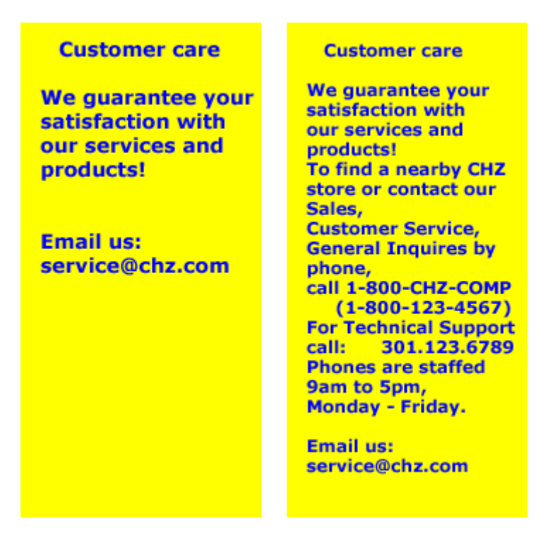
Fig. 1. Limited and extensive customer information